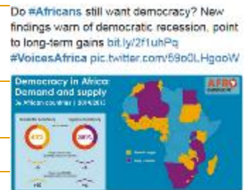
Chart of the month

Attitudes toward renewable energy | by educational attainment | Mauritius | 2014