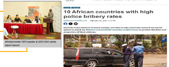
Chart of the month

Access to information held by public officials | 39 countries | 2021/2023