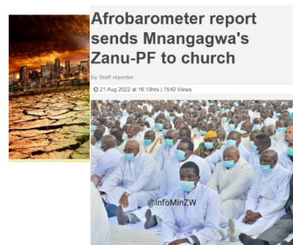
Chart of the month